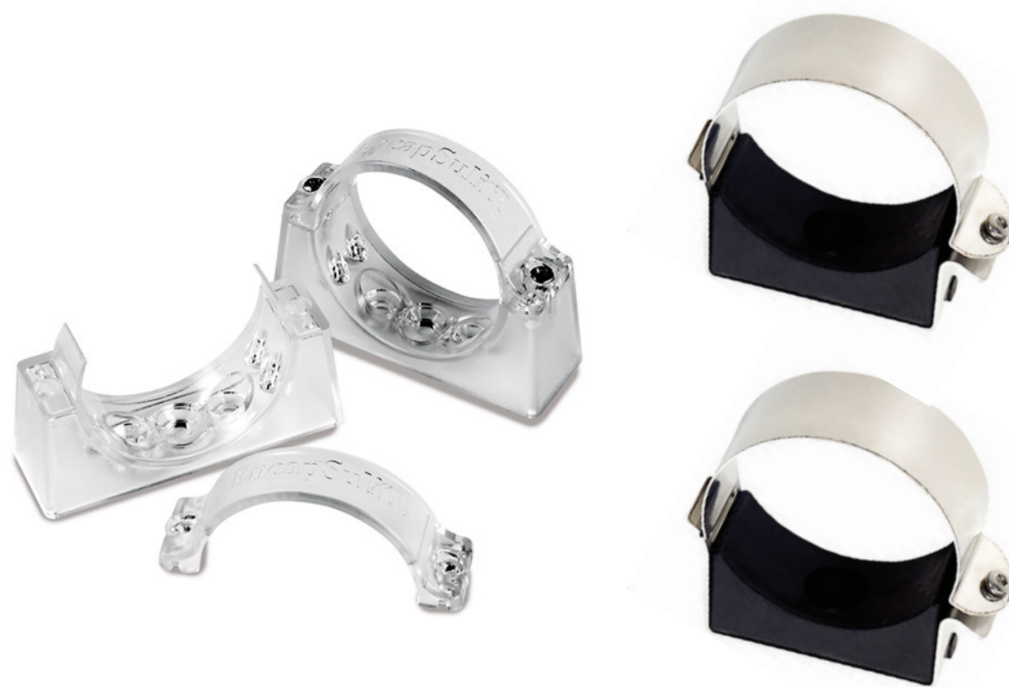
Mounting Brackets Plastic / Metal

IP Rating: IP67 Temperature Range: -20°C To +50°C Warranty: 5 Years IK Rating: IK10